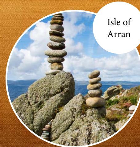
Isle of Arran

Theme: Proliferation of the schooling of Nutrition and Food Technology