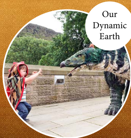
Our Dynamic Earth