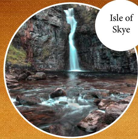
Isle of Skye